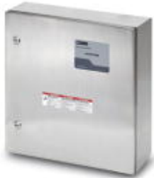
Indoor/outdoor lightning arrester and TVSS system for 120/240 single/split phase

Please be informed that the data shown in this PDF Document is generated from our Online Catalog. Please find the complete data in the user's documentation. Our General Terms of Use for Downloads are valid ( http://phoenixcontact.com/download )