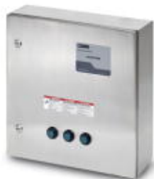
Indoor/outdoor lightning arrester and TVSS system for 277/480 V Wye system

Please be informed that the data shown in this PDF Document is generated from our Online Catalog. Please find the complete data in the user's documentation. Our General Terms of Use for Downloads are valid ( http://phoenixcontact.com/download )