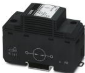
Lightning current arrester with encapsulated N-PE spark gap and ignition electronics, 1-channel. Protection level: 1.5 kV. Housing width: 35 mm (2 Div.)

Please be informed that the data shown in this PDF Document is generated from our Online Catalog. Please find the complete data in the user's documentation. Our General Terms of Use for Downloads are valid ( http://phoenixcontact.com/download )