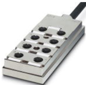
Sensor/actuator box, without LED, with master cable, markers and double-occupied slots

Please be informed that the data shown in this PDF Document is generated from our Online Catalog. Please find the complete data in the user's documentation. Our General Terms of Use for Downloads are valid ( http://phoenixcontact.com/download )