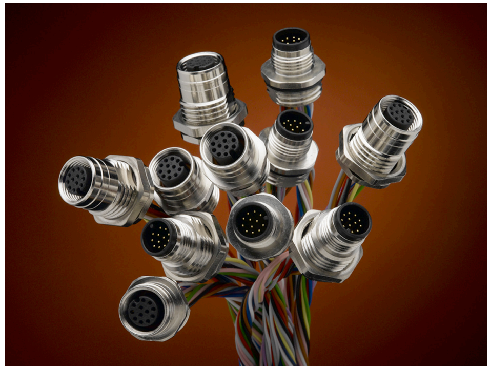
M12 12-Pole Receptacles

Housing: Nickel Plated Brass Contact: Copper Alloy Plating: Gold/Nickel PCB Thickness: 0.6mm Operating Temperature: -25°C / 90°C