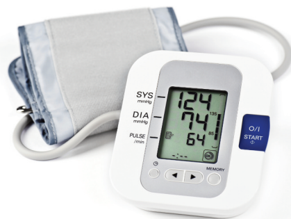
Compact medical applications