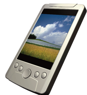
Compact consumer applications