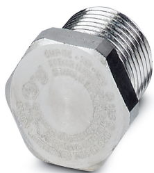
Screw plug, cable gland material: Nickel-plated brass, application: Ex, connecting thread: M20 x 1.5, color: silver

Please be informed that the data shown in this PDF Document is generated from our Online Catalog. Please find the complete data in the user's documentation. Our General Terms of Use for Downloads are valid ( http://phoenixcontact.com/download )