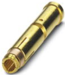
Crimp contact, turned, Contact diameter: 2 mm, Crimp range: 0.25 mm 2 ...1 mm 2

Please be informed that the data shown in this PDF Document is generated from our Online Catalog. Please find the complete data in the user's documentation. Our General Terms of Use for Downloads are valid ( http://phoenixcontact.com/download )