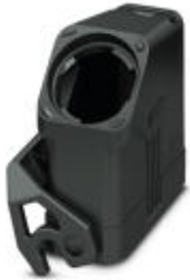
HEAVYCON EVO coupling housing, plastic, with bayonet flange for EVO screw connection, D25, with single locking latch, without EVO screw connection

Please be informed that the data shown in this PDF Document is generated from our Online Catalog. Please find the complete data in the user's documentation. Our General Terms of Use for Downloads are valid ( http://phoenixcontact.com/download )