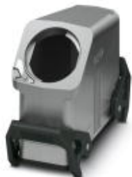
HEAVYCON EVO coupling housing, EMC version, without powder coating, with bayonet flange for EVO screw connection, B24, with double locking latch, height: 90 mm, without EVO screw connection.

Please be informed that the data shown in this PDF Document is generated from our Online Catalog. Please find the complete data in the user's documentation. Our General Terms of Use for Downloads are valid ( http://phoenixcontact.com/download )