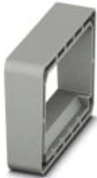
Spacer plate for PLW 16-6/4 feed-through terminal block

Please be informed that the data shown in this PDF Document is generated from our Online Catalog. Please find the complete data in the user's documentation. Our General Terms of Use for Downloads are valid ( http://phoenixcontact.com/download )