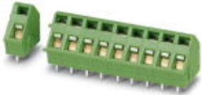
The illustration shows the 10-position version

PCB terminal block, Nominal current: 16 A, Nom. voltage: 400 V, Pitch: 5 mm, Number of positions: 26, Connection method: Spring-cage connection, Mounting: Soldering, Conductor/PCB connection direction: 45 °, Color: green