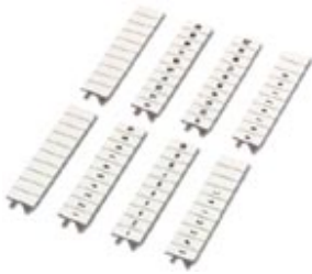
Zack marker strip, 10-section, horizontally labeled with the consecutive numbers: 241 ... 250, white, width: 5 mm

Please be informed that the data shown in this PDF Document is generated from our Online Catalog. Please find the complete data in the user's documentation. Our General Terms of Use for Downloads are valid ( http://phoenixcontact.com/download )