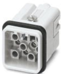
HEAVYCON plug insert, Q12 series, 12-pos., crimp connection, with coding option.

Please be informed that the data shown in this PDF Document is generated from our Online Catalog. Please find the complete data in the user's documentation. Our General Terms of Use for Downloads are valid ( http://phoenixcontact.com/download )