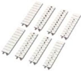
Zack marker strip, 10-section, horizontally labeled with the consecutive numbers: 431 ... 440, white, width: 5 mm

Please be informed that the data shown in this PDF Document is generated from our Online Catalog. Please find the complete data in the user's documentation. Our General Terms of Use for Downloads are valid ( http://phoenixcontact.com/download )