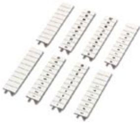
Zack marker strip, 10-section, horizontally labeled with the consecutive numbers: 471 ... 480, white, width: 5 mm

Please be informed that the data shown in this PDF Document is generated from our Online Catalog. Please find the complete data in the user's documentation. Our General Terms of Use for Downloads are valid ( http://phoenixcontact.com/download )