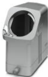
HEAVYCON EVO sleeve housing, EMC version, without powder coating, with bayonet flange for EVO screw connection, B16, for single locking latch, height: 88 mm, without EVO screw connection.

Please be informed that the data shown in this PDF Document is generated from our Online Catalog. Please find the complete data in the user's documentation. Our General Terms of Use for Downloads are valid ( http://phoenixcontact.com/download )