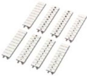
Zack marker strip, 10-section, horizontally labeled with the consecutive numbers: 121 ... 130, white, width: 5 mm

Please be informed that the data shown in this PDF Document is generated from our Online Catalog. Please find the complete data in the user's documentation. Our General Terms of Use for Downloads are valid ( http://phoenixcontact.com/download )