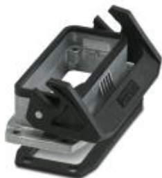
HEAVYCON B16 panel mounting base, with single locking latch, with flat gasket, salt-water-resistant aluminum, conductive profile gasket

Please be informed that the data shown in this PDF Document is generated from our Online Catalog. Please find the complete data in the user's documentation. Our General Terms of Use for Downloads are valid ( http://phoenixcontact.com/download )