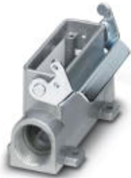
HEAVYCON box mounting base D25, with single locking latch, height 57 mm, with supports 2xM25

Please be informed that the data shown in this PDF Document is generated from our Online Catalog. Please find the complete data in the user's documentation. Our General Terms of Use for Downloads are valid ( http://phoenixcontact.com/download )