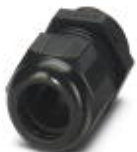
Cable gland, Cable gland material: Polyamide 6, External cable diameter 11 mm ... 17 mm, Shielding: No, Connecting thread: M25

Cable gland - G-INS-M25-M68N-PNES-BK - 1411134