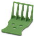
Strain relief for snapping into the latching chambers of the plugs, 4-pos.