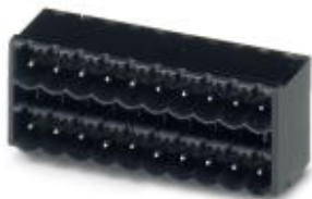
The figure shows a 10-pos. version with 20 contacts

Header, Nominal current: 12 A, Rated voltage (III/2): 400 V, Number of positions: 13, Pitch: 5 mm, Color: black, Contact surface: Tin, Mounting: Taped SMD/THT/THR components