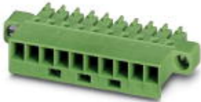
The illustration shows a 16-position version

Plug component, Nominal current: 8 A, Rated voltage (III/2): 160 V, Number of positions: 9, Pitch: 3.81 mm, Connection method: Crimp connection, Color: green, Corresponding female crimp contacts with current [A] and conductor cross section range [mm²] data: 5A/MCC-MT 0,2-0,35 (1859988); 8A/MCC-MT 0,5-1,0 (1859991)