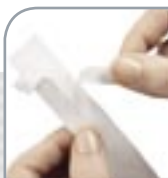
Full backslit for easy peel