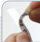
Dry-edges for easy removal