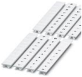
Zack marker strip, 10-section, vertically labeled with the consecutive numbers: 21 ... 30, white, width: 8 mm

Please be informed that the data shown in this PDF Document is generated from our Online Catalog. Please find the complete data in the user's documentation. Our General Terms of Use for Downloads are valid ( http://phoenixcontact.com/download )