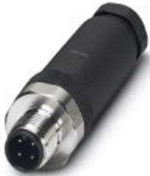
Sensor/actuator connector, male, straight, 4-pos., M12, screw connection, high-grade steel knurl, cable screw connection Pg9

Please be informed that the data shown in this PDF Document is generated from our Online Catalog. Please find the complete data in the user's documentation. Our General Terms of Use for Downloads are valid ( http://phoenixcontact.com/download )