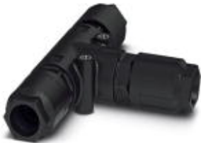
QUICKON T-distributor, black, 4+PE-pos., 2.5 mm 2 ... 6.0 mm 2 /690 V/40 A, for cable diameter of 9 mm ... 14 mm, with three QUICKON nuts

Please be informed that the data shown in this PDF Document is generated from our Online Catalog. Please find the complete data in the user's documentation. Our General Terms of Use for Downloads are valid ( http://phoenixcontact.com/download )