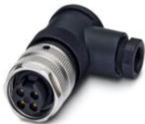
Sensor/actuator connector, female, angled, 4-pos., 7/8", screw connection, metal knurl, cable screw connection Pg9

Please be informed that the data shown in this PDF Document is generated from our Online Catalog. Please find the complete data in the user's documentation. Our General Terms of Use for Downloads are valid ( http://phoenixcontact.com/download )