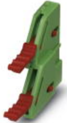
Ejectors, for assembly on each side of the header

Please be informed that the data shown in this PDF Document is generated from our Online Catalog. Please find the complete data in the user's documentation. Our General Terms of Use for Downloads are valid ( http://phoenixcontact.com/download )