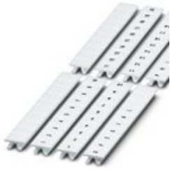
Zack marker strip, 10-section, vertically labeled with the consecutive numbers: 11 ... 20, white, width: 8 mm

Please be informed that the data shown in this PDF Document is generated from our Online Catalog. Please find the complete data in the user's documentation. Our General Terms of Use for Downloads are valid ( http://phoenixcontact.com/download )