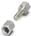
Mounting set, for DSUB gender changer contact inserts