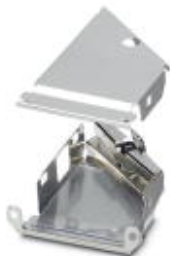
D-SUB EMC inner sleeve, shell size 3, for sleeve housing VS-25-...

Please be informed that the data shown in this PDF Document is generated from our Online Catalog. Please find the complete data in the user's documentation. Our General Terms of Use for Downloads are valid ( http://phoenixcontact.com/download )