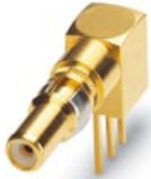
Coaxial contact, for D-SUB combination inserts, for PCB assembly, socket, angled, gold-plated

Please be informed that the data shown in this PDF Document is generated from our Online Catalog. Please find the complete data in the user's documentation. Our General Terms of Use for Downloads are valid ( http://phoenixcontact.com/download )