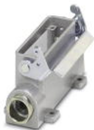
Box mounting base, with single locking latch, height 57 mm, with screw connection, 1x Pg21

Please be informed that the data shown in this PDF Document is generated from our Online Catalog. Please find the complete data in the user's documentation. Our General Terms of Use for Downloads are valid ( http://phoenixcontact.com/download )