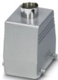
Sleeve housing, for double locking latch, height 76 mm, with screw connection, 1x Pg21, straight cable entry

Please be informed that the data shown in this PDF Document is generated from our Online Catalog. Please find the complete data in the user's documentation. Our General Terms of Use for Downloads are valid ( http://phoenixcontact.com/download )