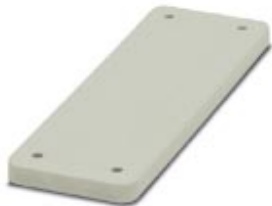
HEAVYCON cover plate, for wall cutouts of type B24, 7 mm thick, gray

Please be informed that the data shown in this PDF Document is generated from our Online Catalog. Please find the complete data in the user's documentation. Our General Terms of Use for Downloads are valid ( http://phoenixcontact.com/download )