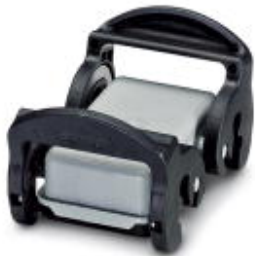
HEAVYCON protective cover, type B10, for sleeve housing without double locking latch, with retaining cord, IP54

Please be informed that the data shown in this PDF Document is generated from our Online Catalog. Please find the complete data in the user's documentation. Our General Terms of Use for Downloads are valid ( http://phoenixcontact.com/download )