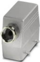
Sleeve housing, for double locking latch, height 76 mm, with screw connection, 1x Pg21, lateral cable entry

Please be informed that the data shown in this PDF Document is generated from our Online Catalog. Please find the complete data in the user's documentation. Our General Terms of Use for Downloads are valid ( http://phoenixcontact.com/download )