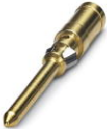
Turned 1.6 crimp contact, individual male contact, core diameter 0.75 to 1.00 mm 2 , gold-plated

Please be informed that the data shown in this PDF Document is generated from our Online Catalog. Please find the complete data in the user's documentation. Our General Terms of Use for Downloads are valid ( http://phoenixcontact.com/download )