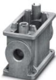
HEAVYCON ADVANCE B10 box mounting base, for M6 screw locking, salt-water-resistant aluminum, with 2 x M20 thread, without surface coating

Please be informed that the data shown in this PDF Document is generated from our Online Catalog. Please find the complete data in the user's documentation. Our General Terms of Use for Downloads are valid ( http://phoenixcontact.com/download )