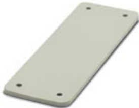
HEAVYCON cover plate, for panel cutouts of type B10/HV3, 3.5 mm thick, gray

Please be informed that the data shown in this PDF Document is generated from our Online Catalog. Please find the complete data in the user's documentation. Our General Terms of Use for Downloads are valid ( http://phoenixcontact.com/download )