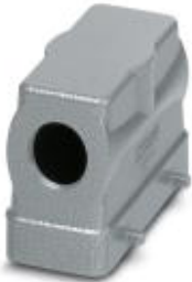
HEAVYCON B16 sleeve housing, for double locking latch, height: 65 mm, with 1 x M32 thread, lateral cable outlet

Please be informed that the data shown in this PDF Document is generated from our Online Catalog. Please find the complete data in the user's documentation. Our General Terms of Use for Downloads are valid ( http://phoenixcontact.com/download )