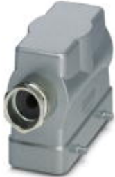
HEAVYCON B16 sleeve housing, for double locking latch, height: 76 mm, with 1 x Pg21 screw connection, lateral cable outlet

Please be informed that the data shown in this PDF Document is generated from our Online Catalog. Please find the complete data in the user's documentation. Our General Terms of Use for Downloads are valid ( http://phoenixcontact.com/download )