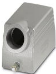
HEAVYCON sleeve housing HV3, for single locking latch, height 52 mm, with support 1x M25, lateral conductor exit

Please be informed that the data shown in this PDF Document is generated from our Online Catalog. Please find the complete data in the user's documentation. Our General Terms of Use for Downloads are valid ( http://phoenixcontact.com/download )