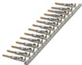
Rolled pin contact, taped, silver-plated, 0.5 mm² ... 1.5 mm², contact entry from left, 2000 pcs. per roll

Please be informed that the data shown in this PDF Document is generated from our Online Catalog. Please find the complete data in the user's documentation. Our General Terms of Use for Downloads are valid ( http://phoenixcontact.com/download )