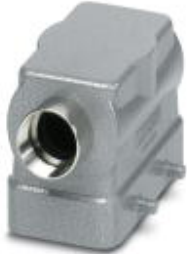
HEAVYCON B10 sleeve housing, for double locking latch, height: 56 mm, with 1 x M20 gland, lateral cable outlet

Please be informed that the data shown in this PDF Document is generated from our Online Catalog. Please find the complete data in the user's documentation. Our General Terms of Use for Downloads are valid ( http://phoenixcontact.com/download )