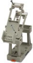
HEAVYCON connector assembly frame, for contact inserts of type B10

Please be informed that the data shown in this PDF Document is generated from our Online Catalog. Please find the complete data in the user's documentation. Our General Terms of Use for Downloads are valid ( http://phoenixcontact.com/download )