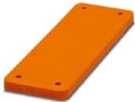
Cover plate, reinforced, for individual processing, for HC-B 24 cutouts, cutout 36 x 113 mm, for type B24

Please be informed that the data shown in this PDF Document is generated from our Online Catalog. Please find the complete data in the user's documentation. Our General Terms of Use for Downloads are valid ( http://phoenixcontact.com/download )