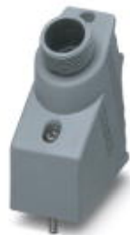
Plastic sleeve housing, locking screws with cylindrical head, type 1, cable screw connection Pg16

Please be informed that the data shown in this PDF Document is generated from our Online Catalog. Please find the complete data in the user's documentation. Our General Terms of Use for Downloads are valid ( http://phoenixcontact.com/download )