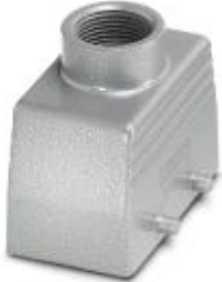
Sleeve housing, for double locking latch, height: 45 mm, with supports, 1 x Pg16, straight cable outlet

Please be informed that the data shown in this PDF Document is generated from our Online Catalog. Please find the complete data in the user's documentation. Our General Terms of Use for Downloads are valid ( http://phoenixcontact.com/download )